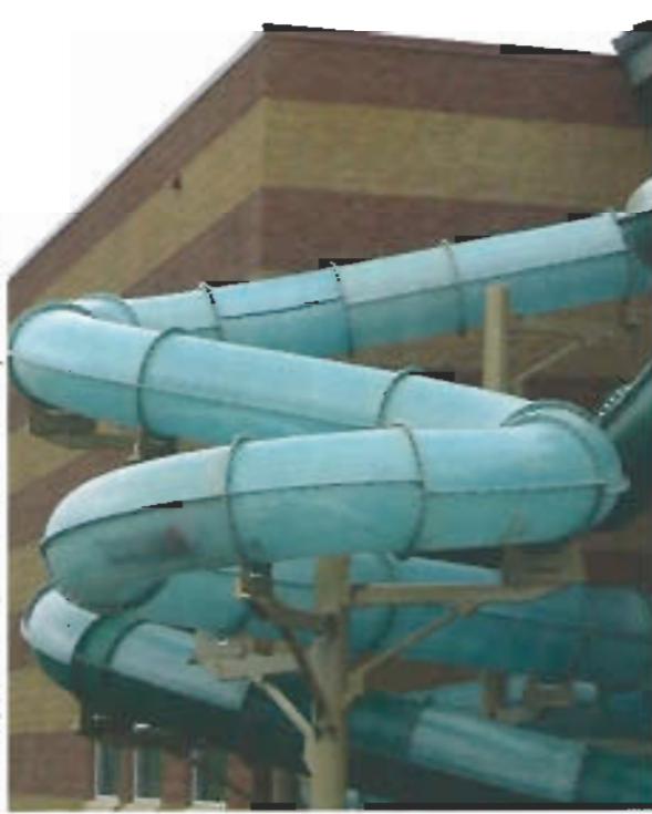
At the West River Community Center in Dickinson, N.D., different colors of CMU blocks create a striped custom look.