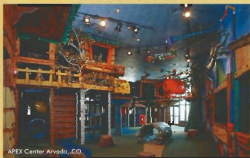
APEX Center Arvada, CO