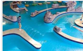
The pools in the new Recreation Center are two or three weeks away from completion. Workers began testing the pool's new features in the water park section of the building Tuesday, while others worked on the finishing touches in the lap pool area.