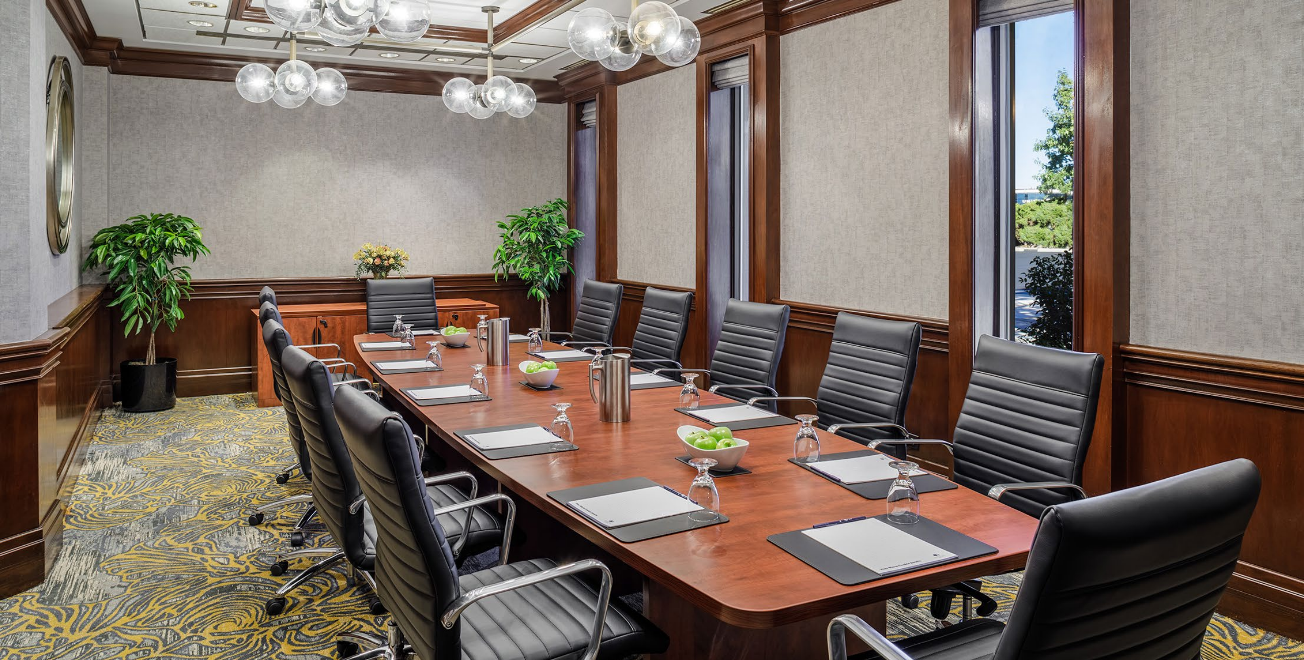
DOUBLETREE BY HILTON – CONFERENCE CENTER AND SPORTS BAR | DENVER, CO