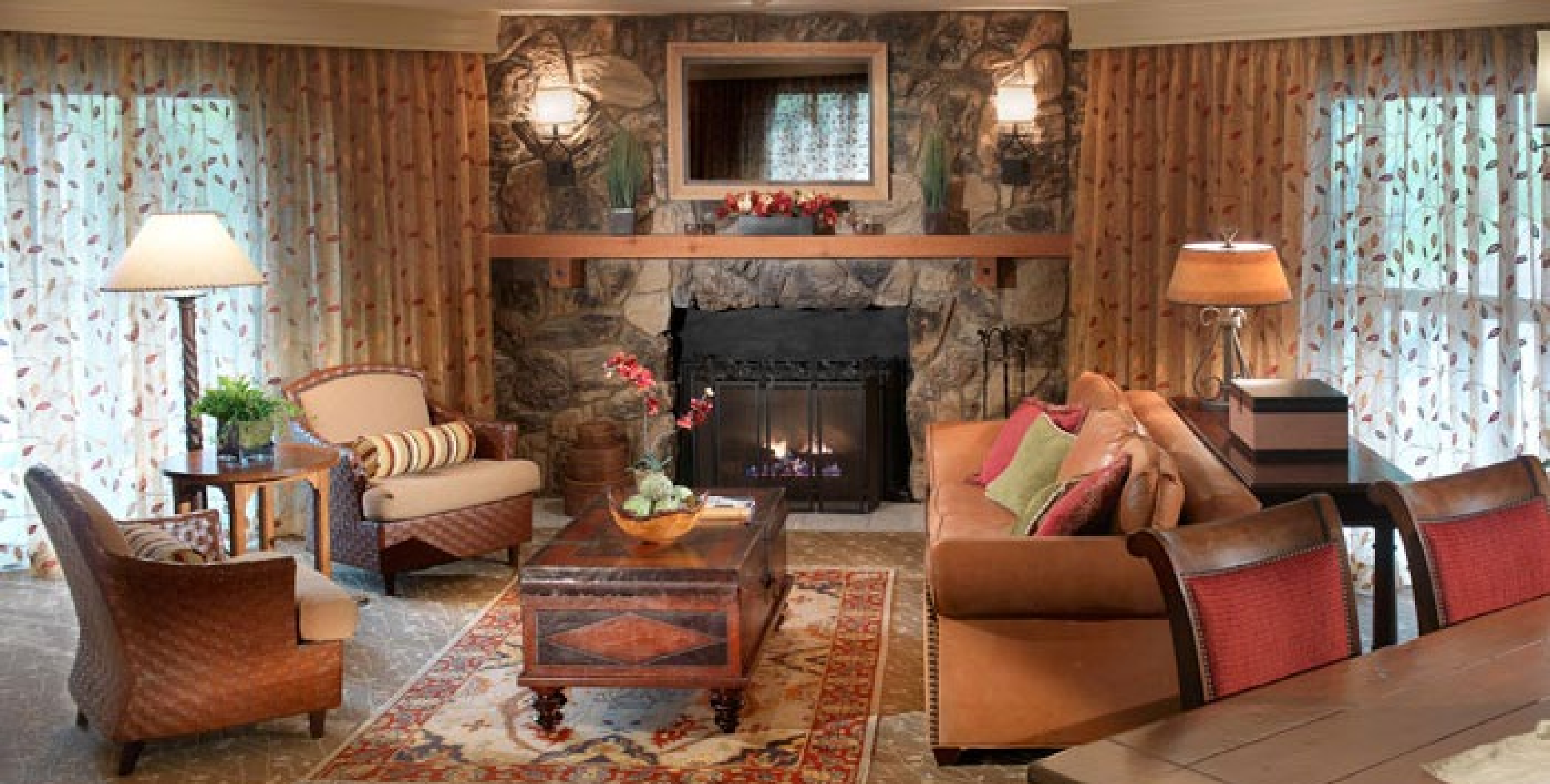
CHEYENNE MOUNTAIN RESORT | COLORADO SPRINGS, CO