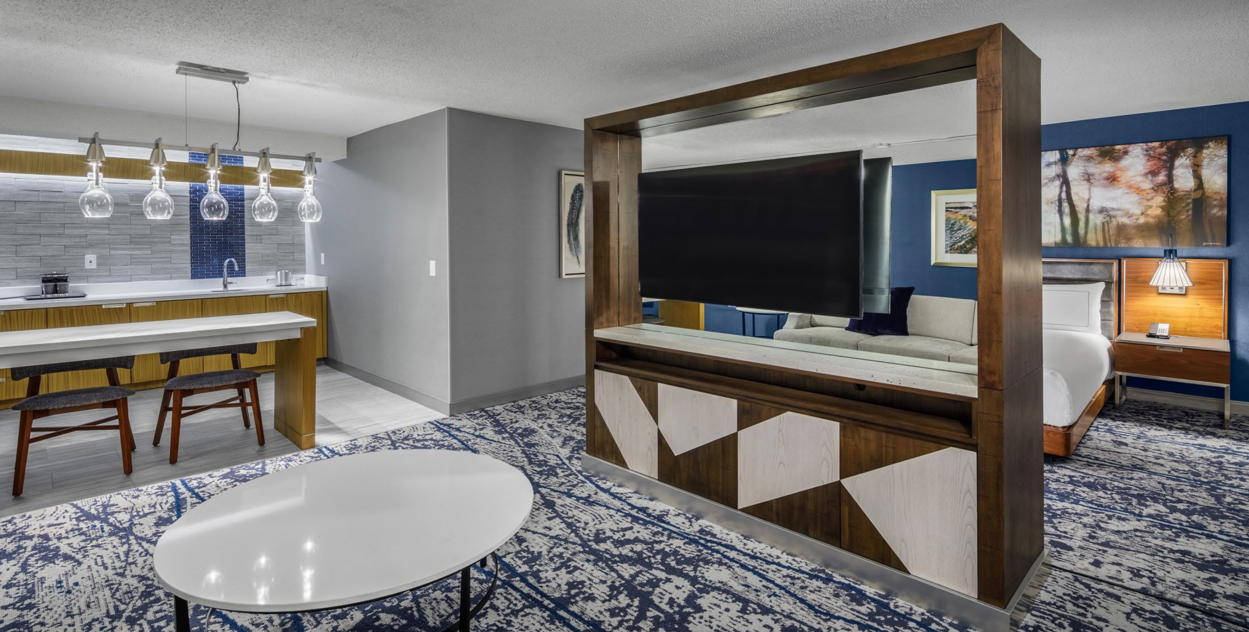
DOUBLETREE BY HILTON GUESTROOM RENOVATION | DENVER, CO