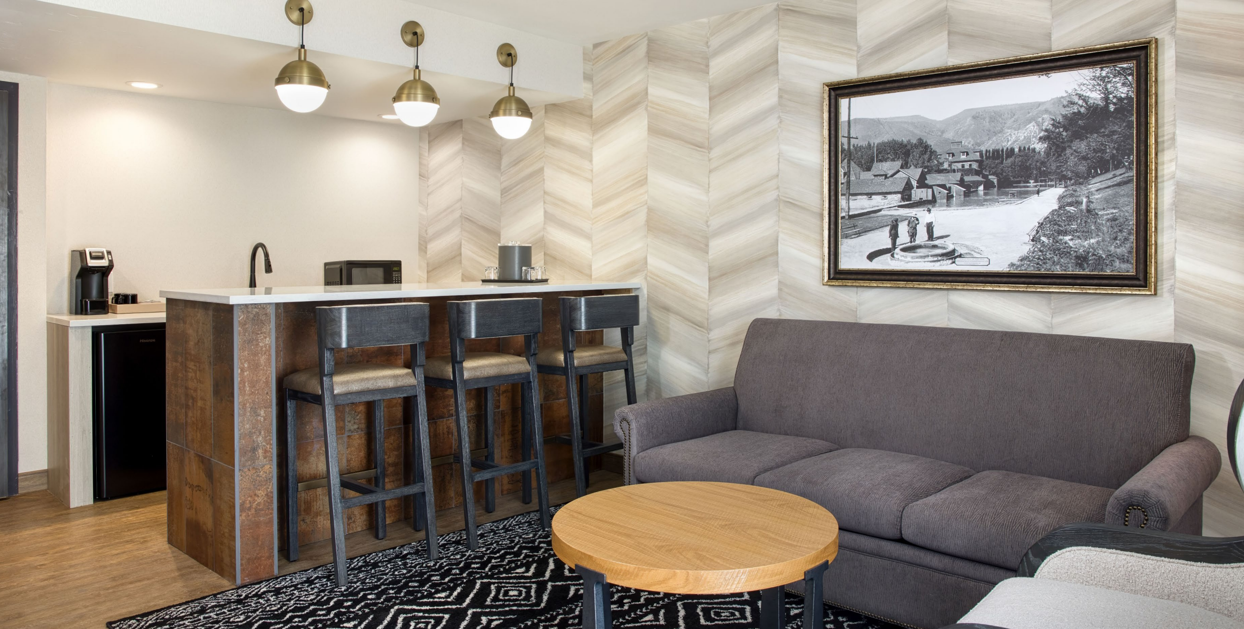
GLENWOOD HOT SPRINGS RESORT – THE LODGE GUESTROOM RENO | GLENWOOD SPRINGS, CO