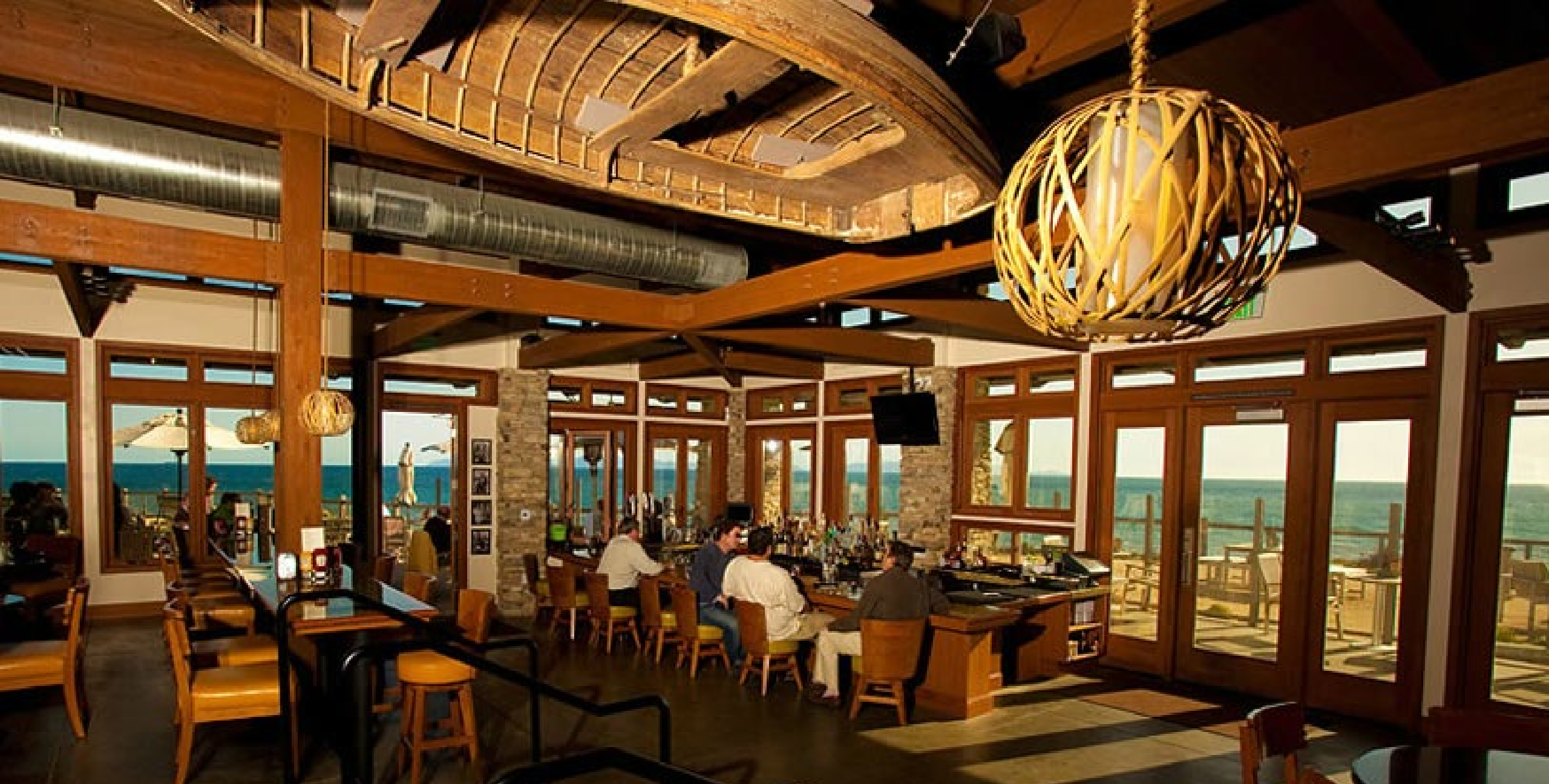
NELSON'S POINT BAR TERRANEA RESORT | RANCHO PALOS VERDES, CA