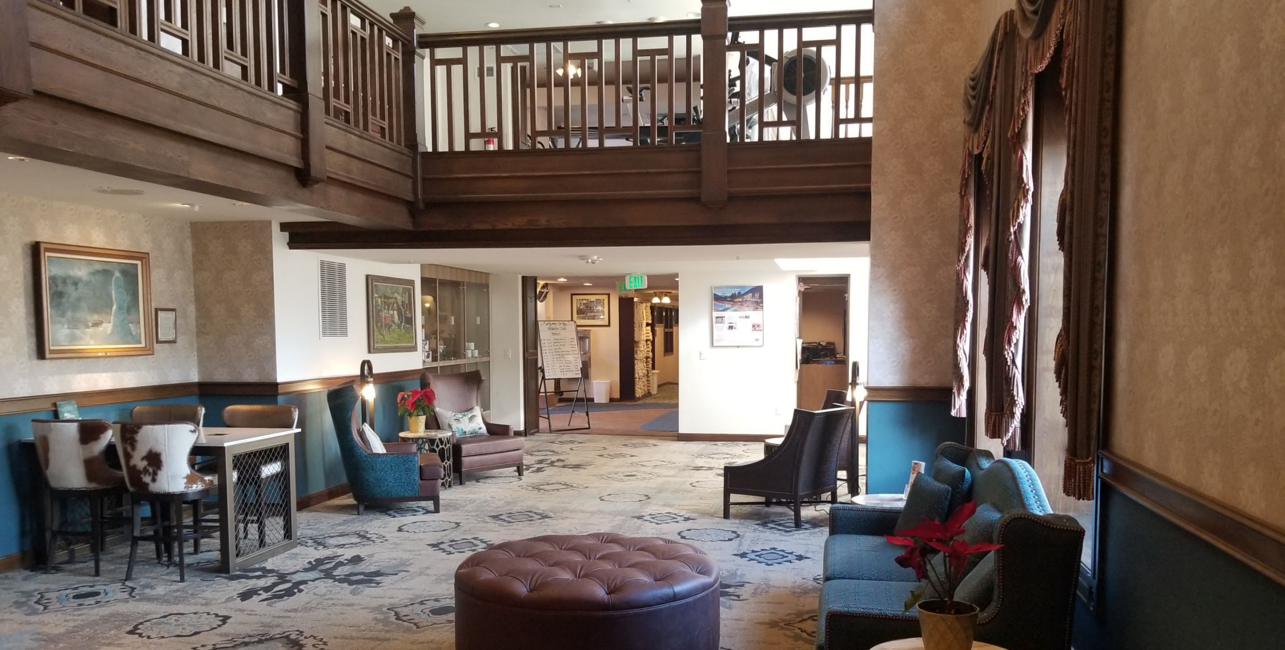
GLENWOOD HOT SPRINGS RESORT – LOUNGE AND CLUB LOBBY RENO | GLENWOOD SPRINGS, CO