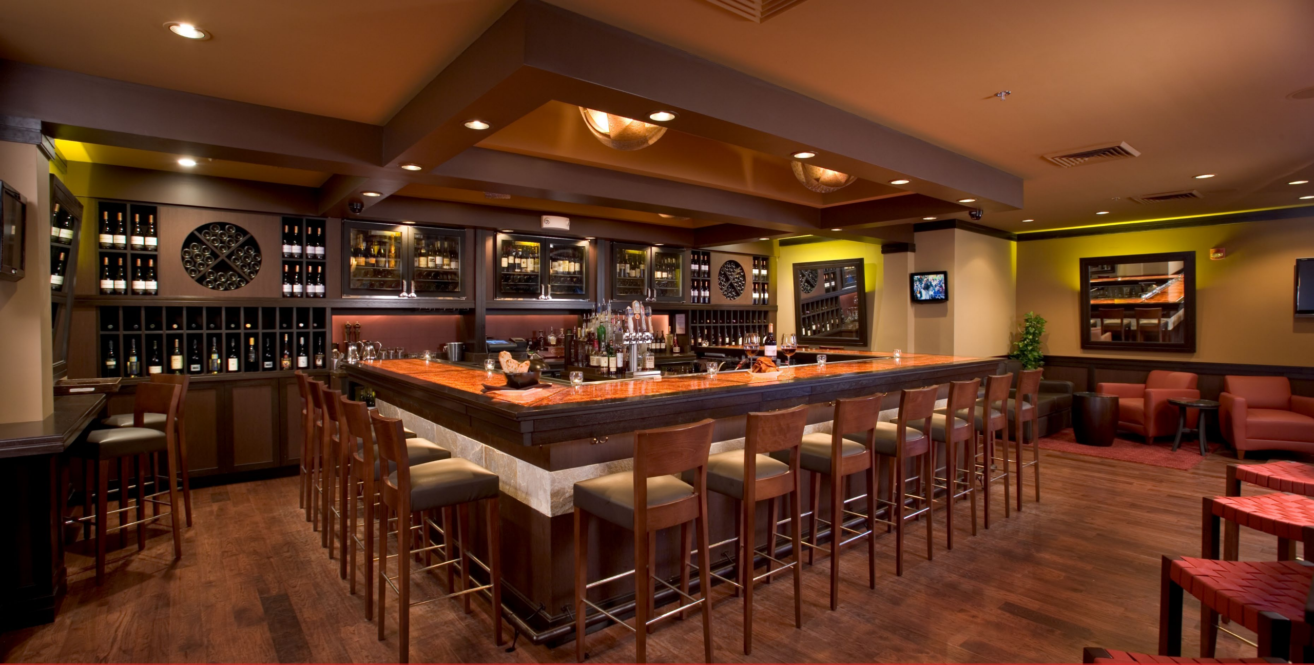
MAXWELL'S RESTAURANT AND BAR | GREENWOOD VILLAGE, CO