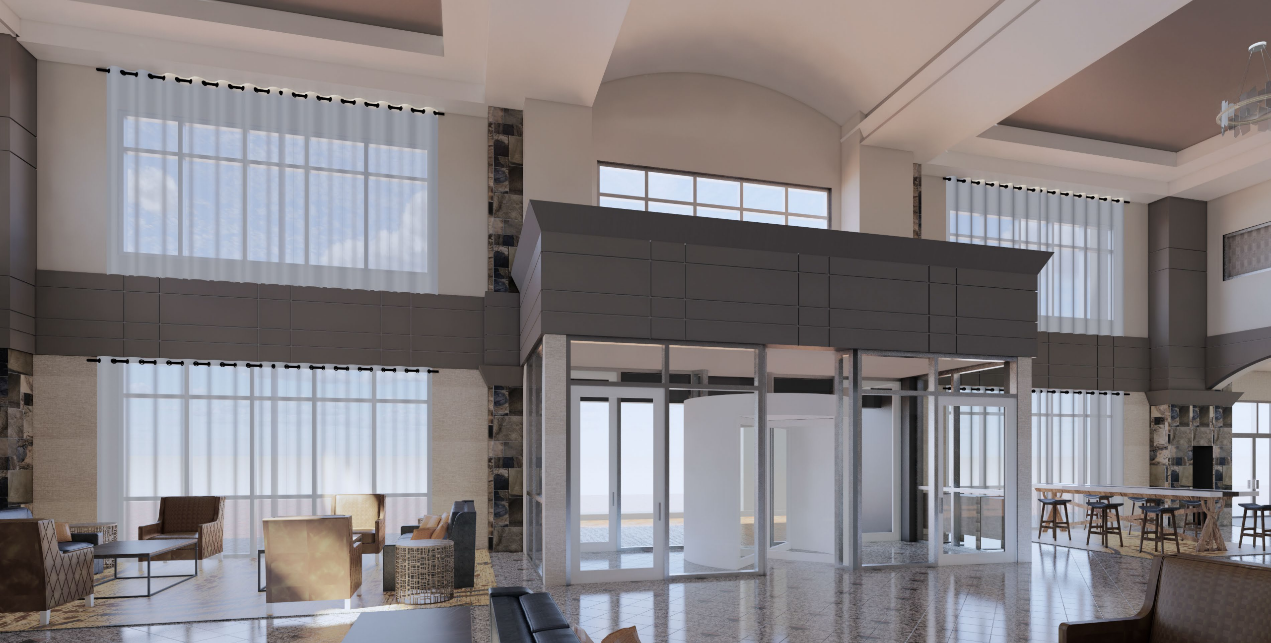
DOUBLETREE BY HILTON – CENTRAL PARK | DENVER, CO (DESIGN ONLY)