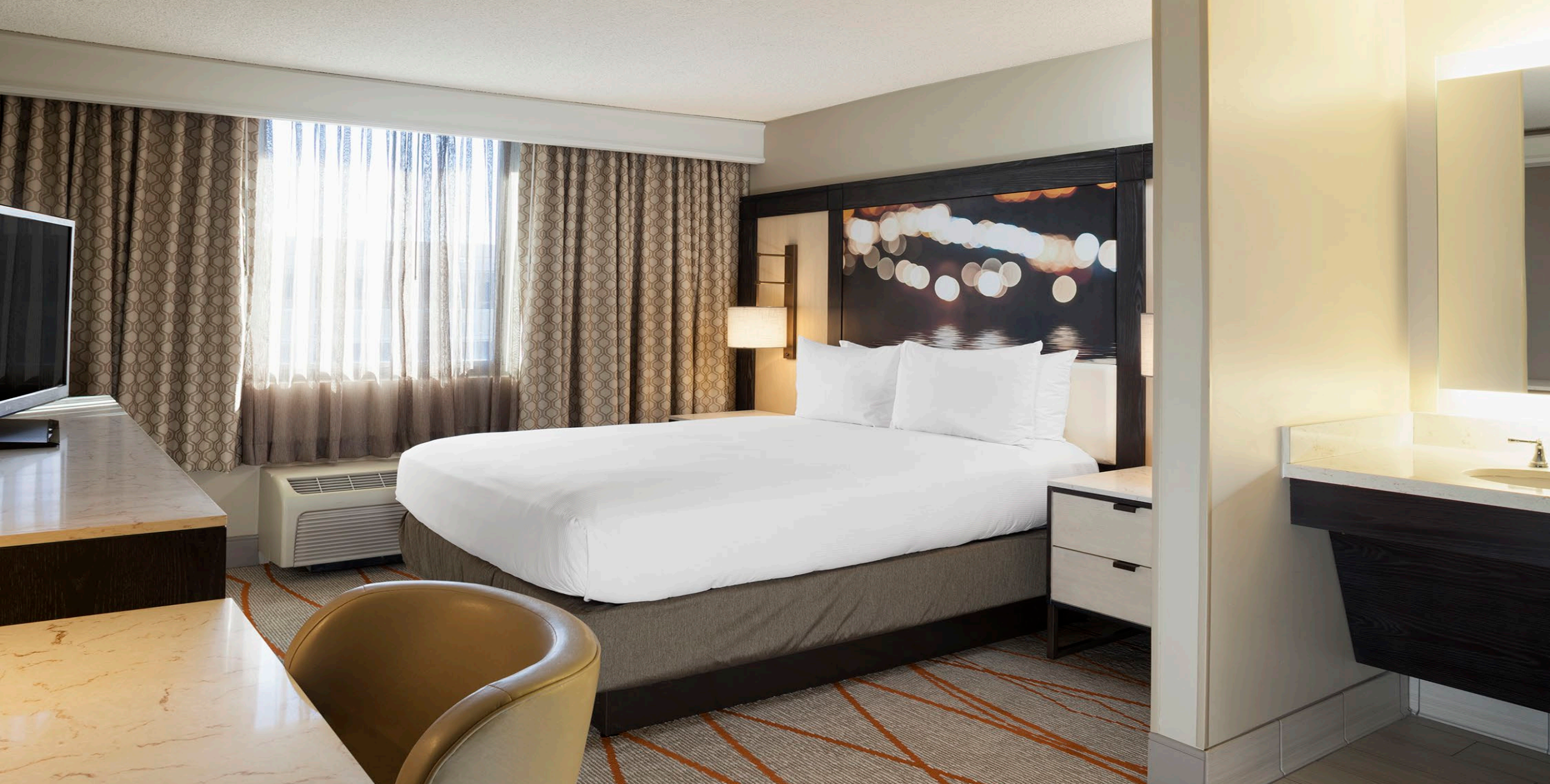
DOUBLETREE BY HILTON – CENTRAL PARK | DENVER, CO