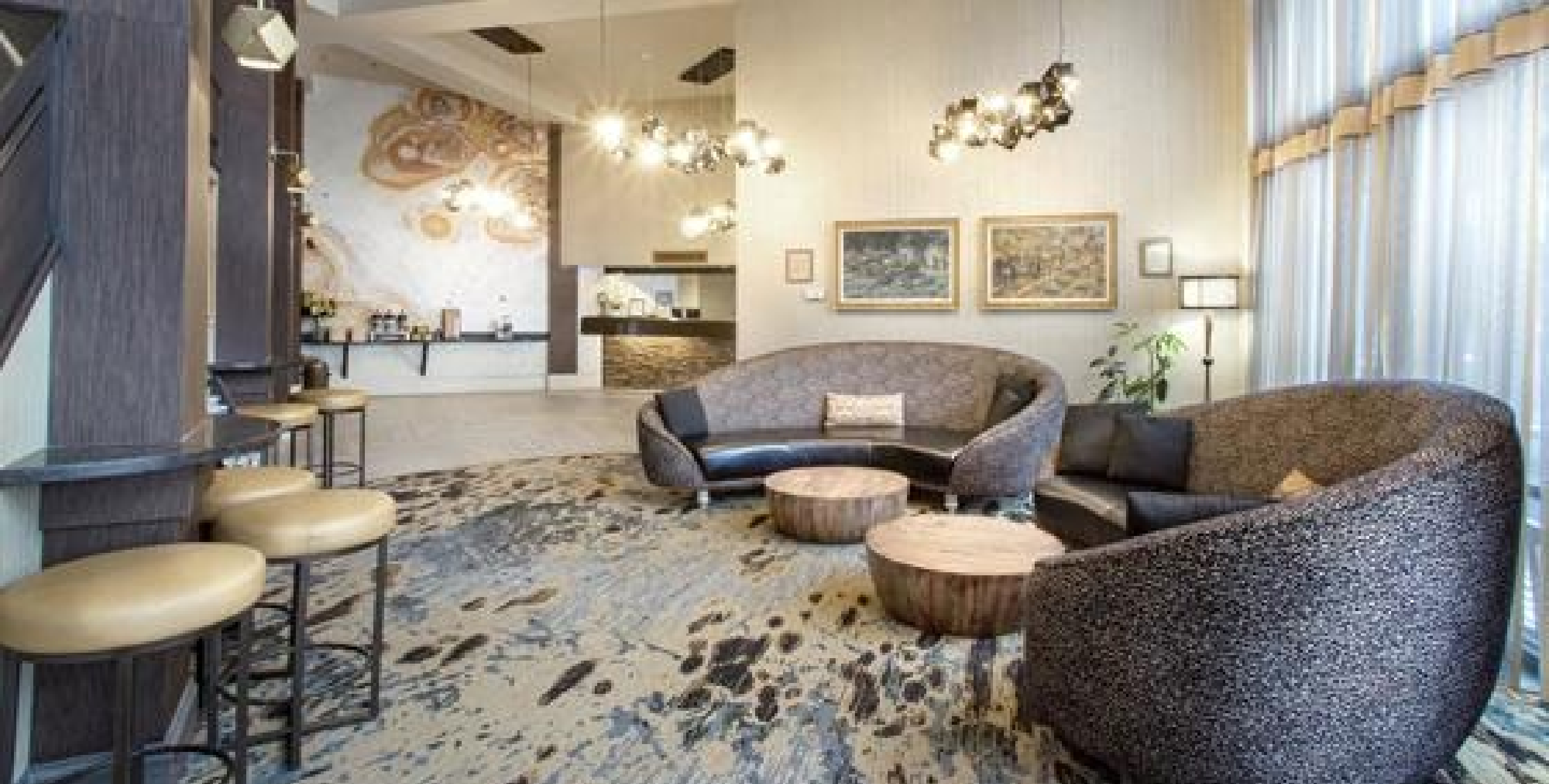
GLENWOOD HOT SPRINGS RESORT – LOUNGE AND CLUB LOBBY RENO | GLENWOOD SPRINGS, CO