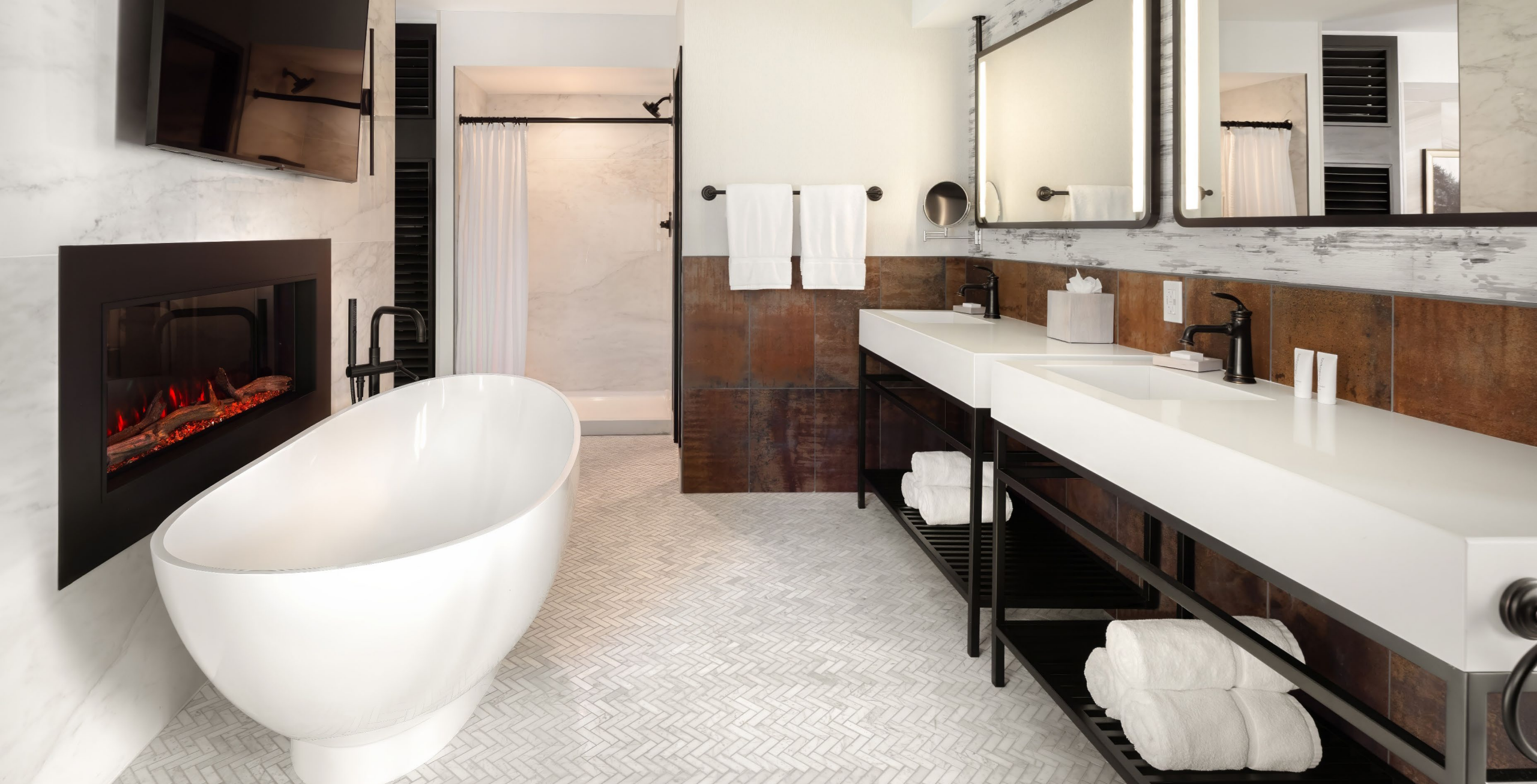
GLENWOOD HOT SPRINGS RESORT – THE LODGE GUESTROOM RENO | GLENWOOD SPRINGS, CO