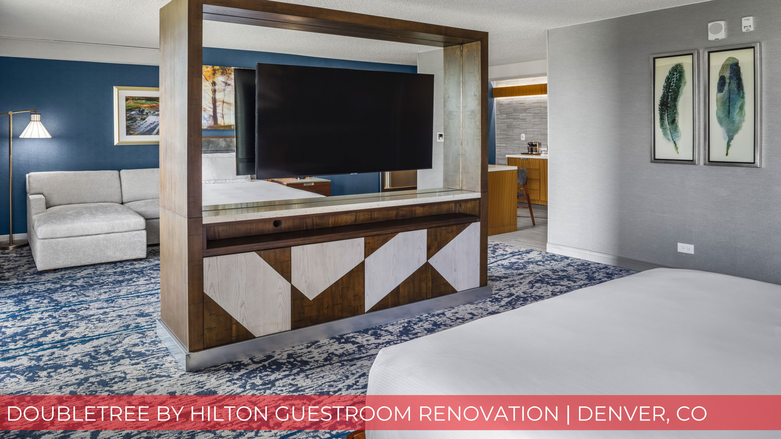
DOUBLETREE BY HILTON GUESTROOM RENOVATION | DENVER, CO