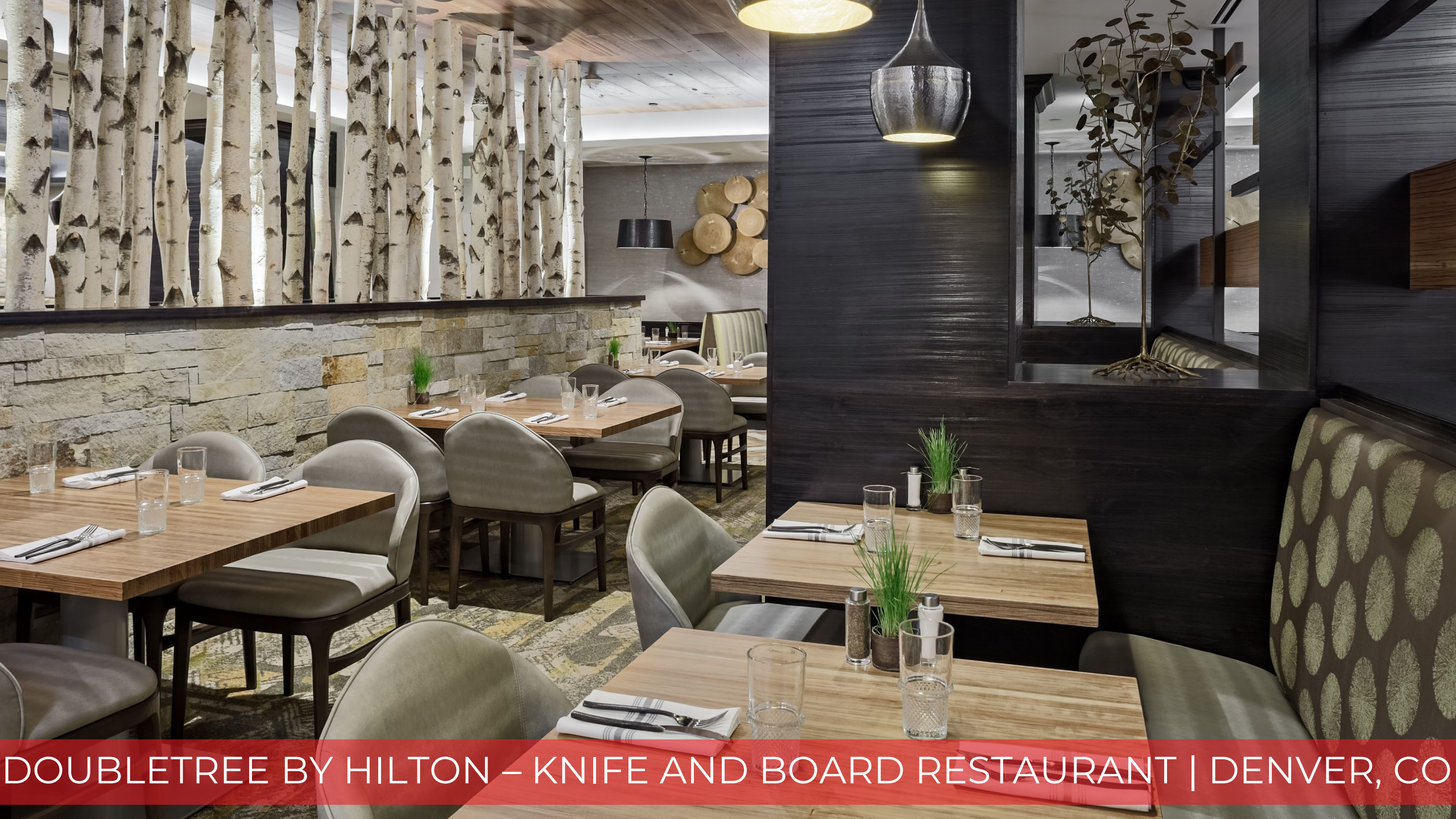
DOUBLETREE BY HILTON – KNIFE AND BOARD RESTAURANT | DENVER, CO