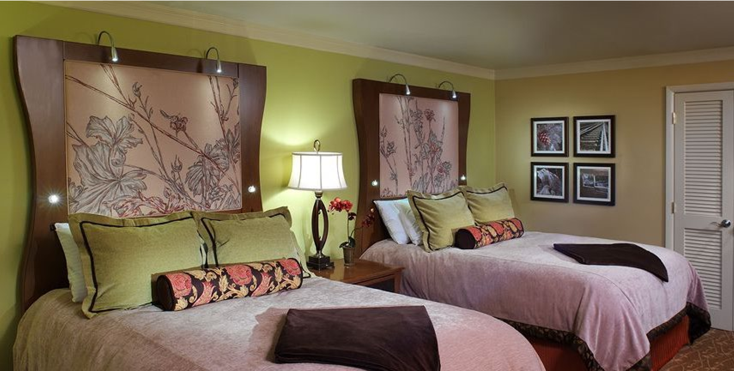
CHEYENNE MOUNTAIN RESORT | COLORADO SPRINGS, CO