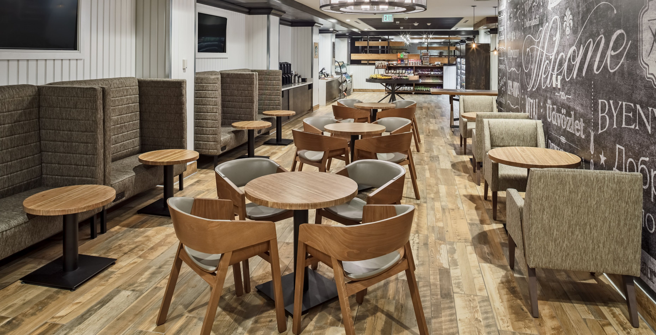
DOUBLETREE BY HILTON – GROUNDED GRAB N' GO | DENVER, CO