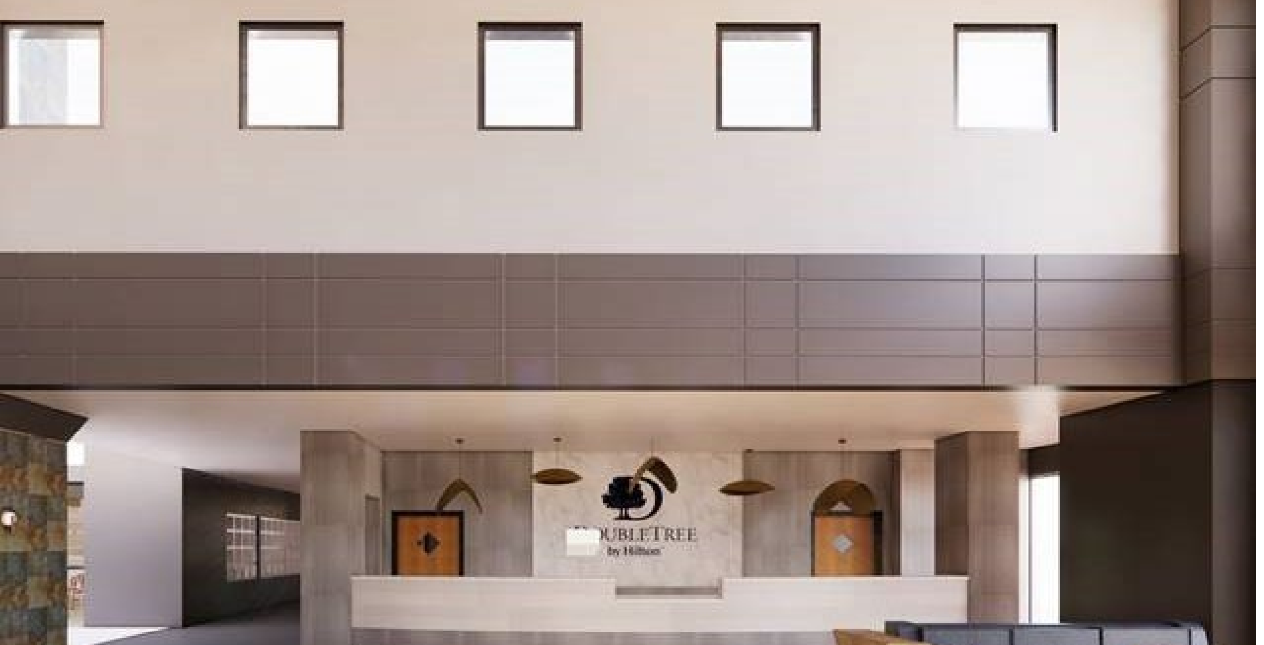
DOUBLETREE BY HILTON – CENTRAL PARK | DENVER, CO (DESIGN ONLY)