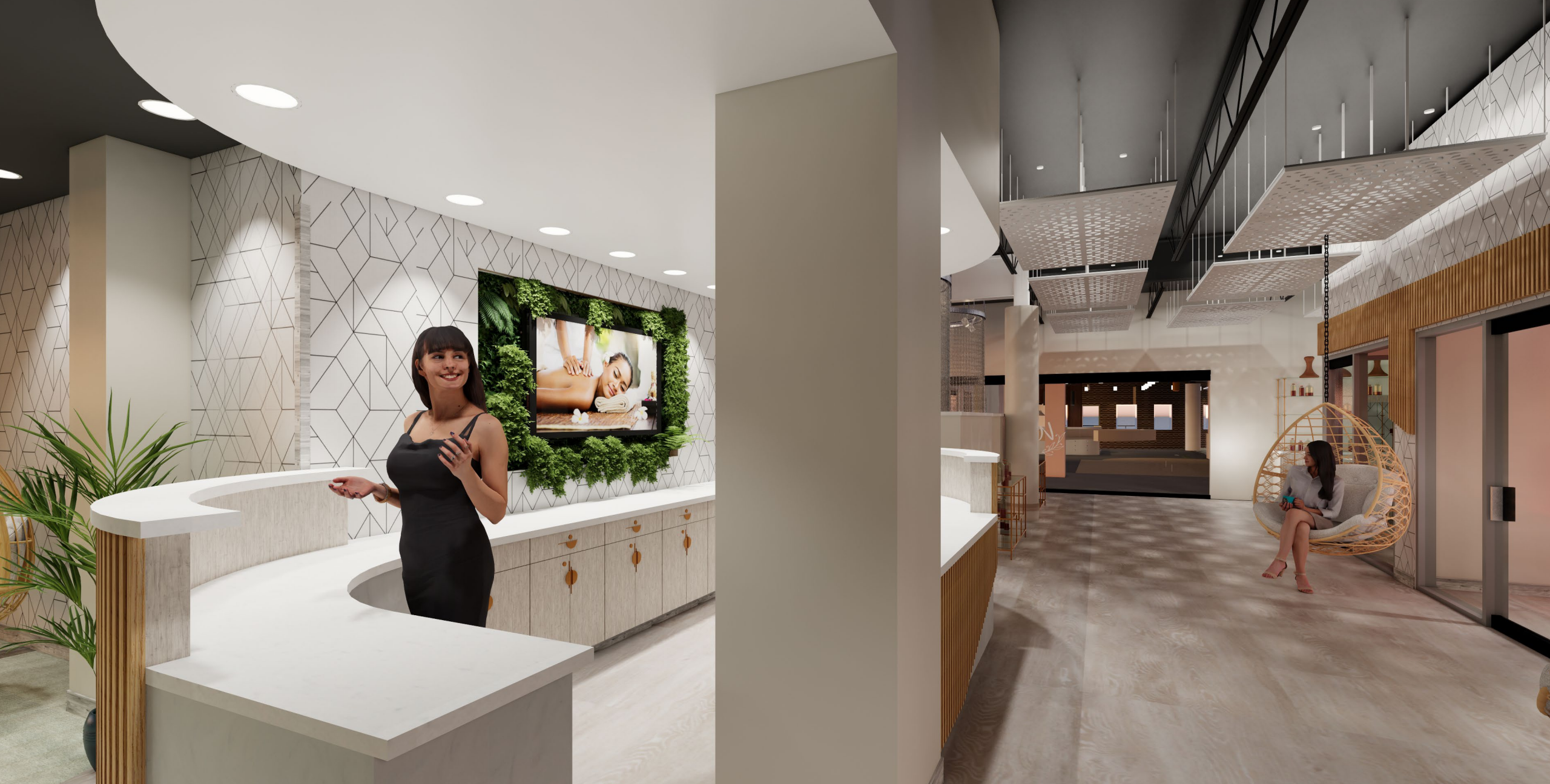
NEWTOWN ATHLETIC CLUB WELL LOUNGE | NEWTOWN, PA