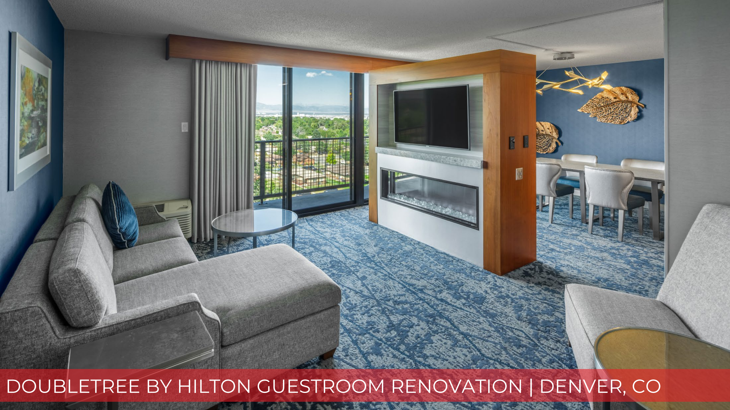
DOUBLETREE BY HILTON GUESTROOM RENOVATION | DENVER, CO