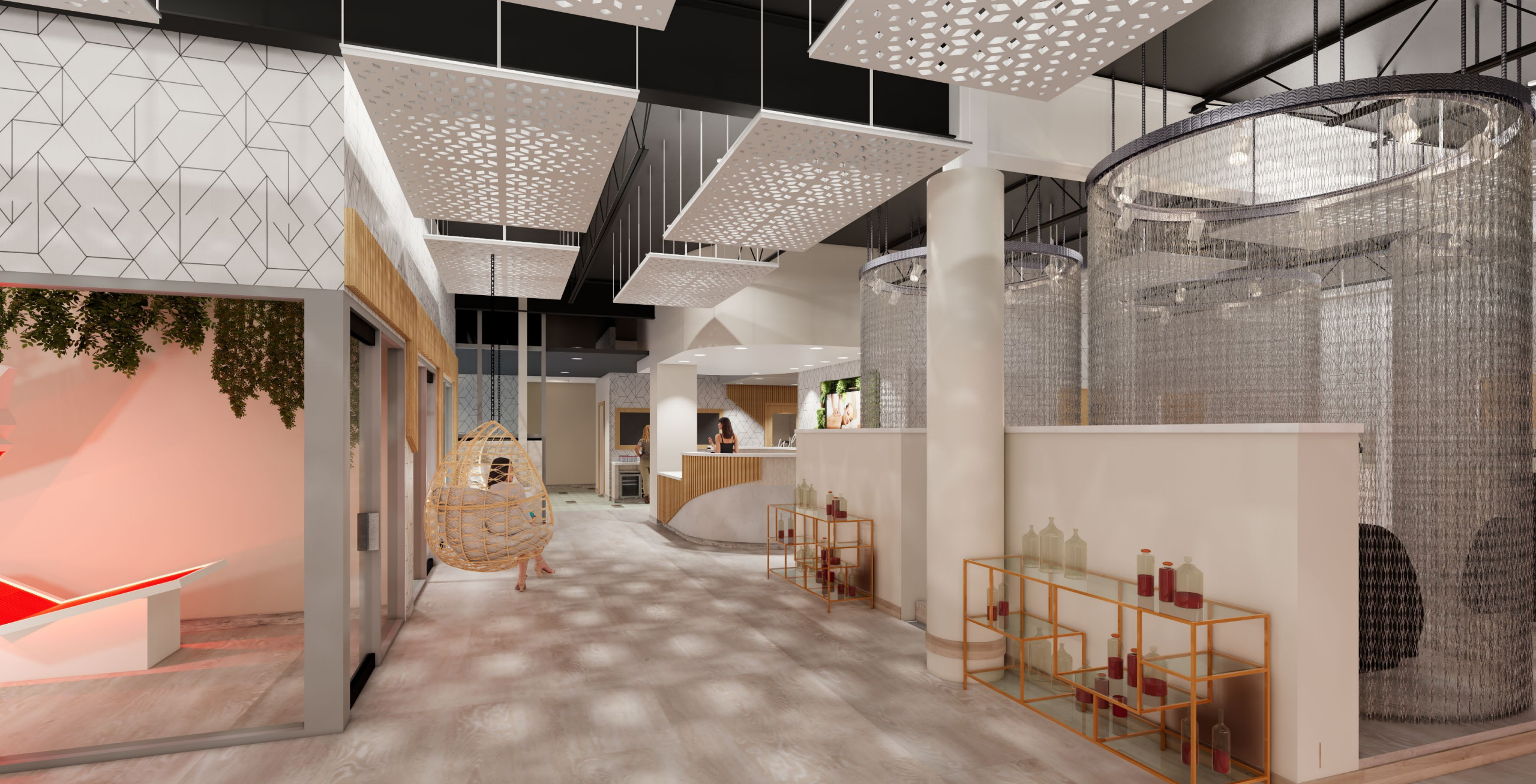
NEWTOWN ATHLETIC CLUB WELL LOUNGE | NEWTOWN, PA