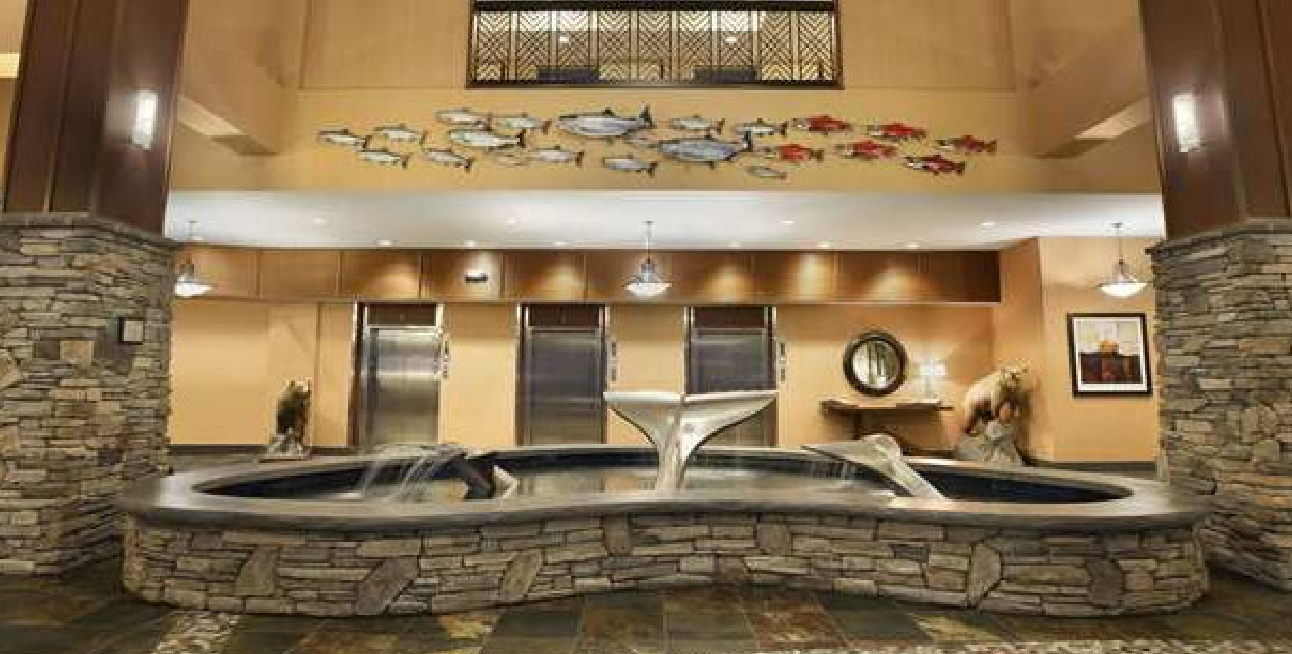
EMBASSY SUITES | ANCHORAGE, AK