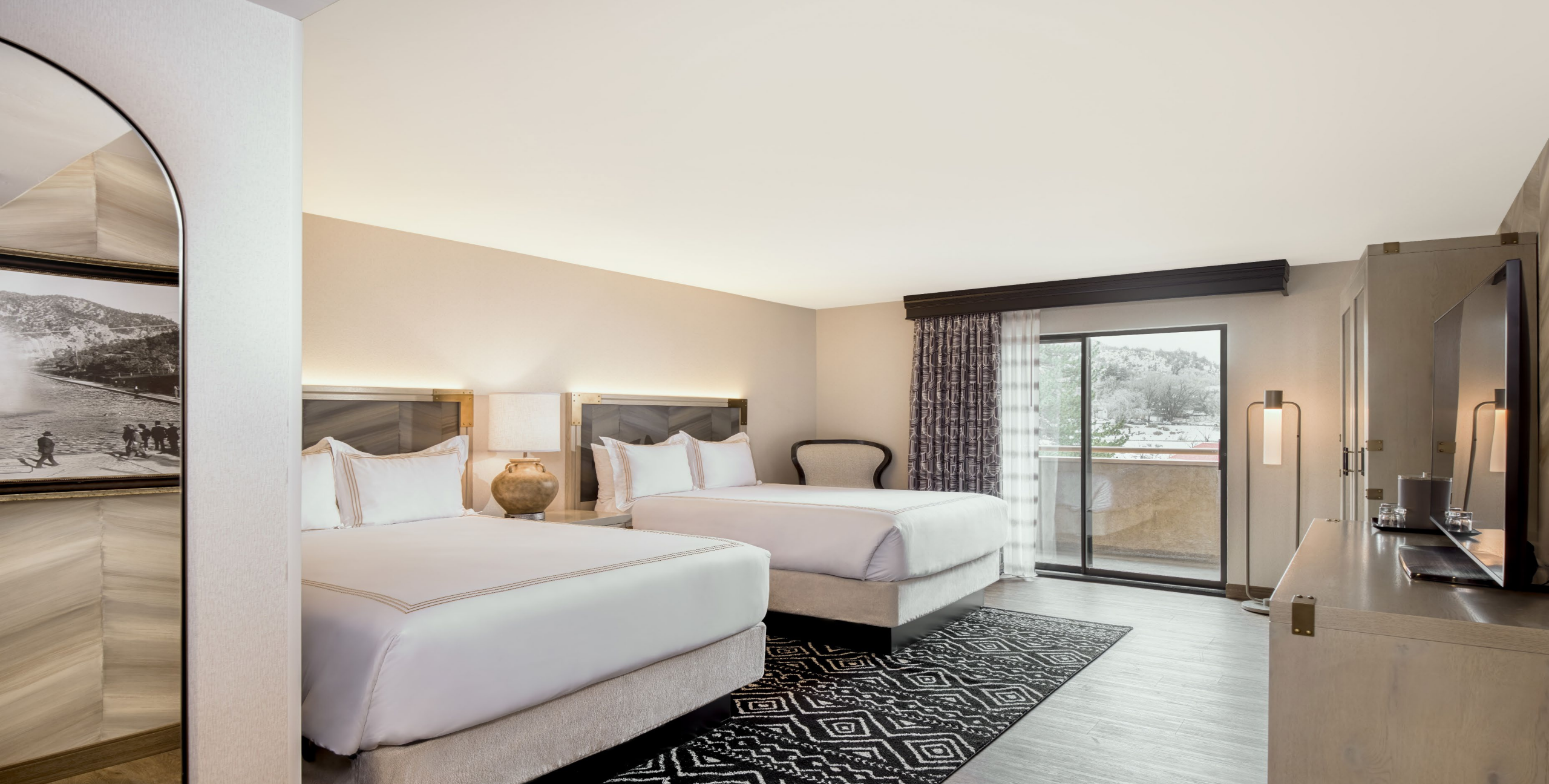
GLENWOOD HOT SPRINGS RESORT – THE LODGE GUESTROOM RENO | GLENWOOD SPRINGS, CO