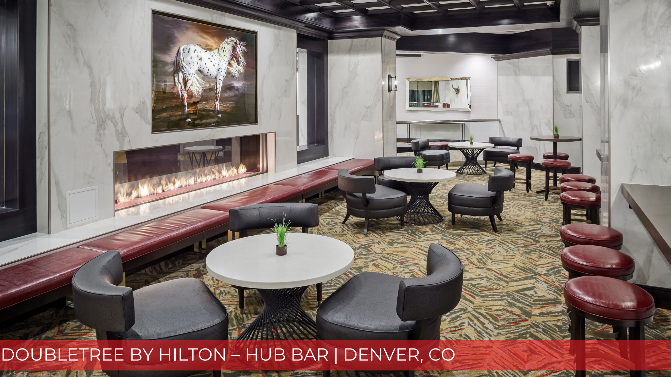
DOUBLETREE BY HILTON – HUB BAR | DENVER, CO