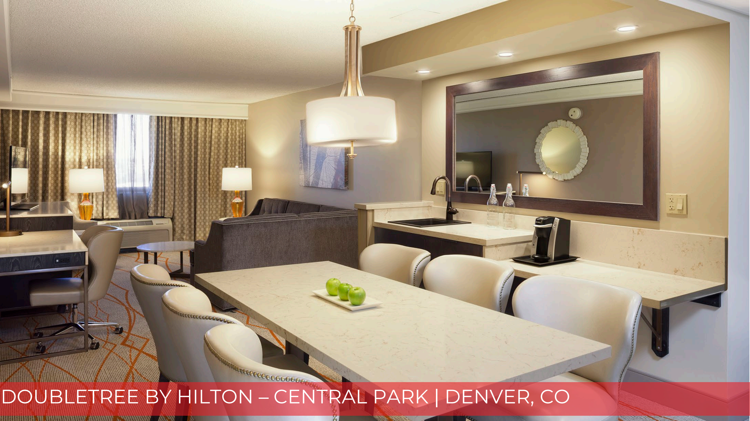
DOUBLETREE BY HILTON – CENTRAL PARK | DENVER, CO