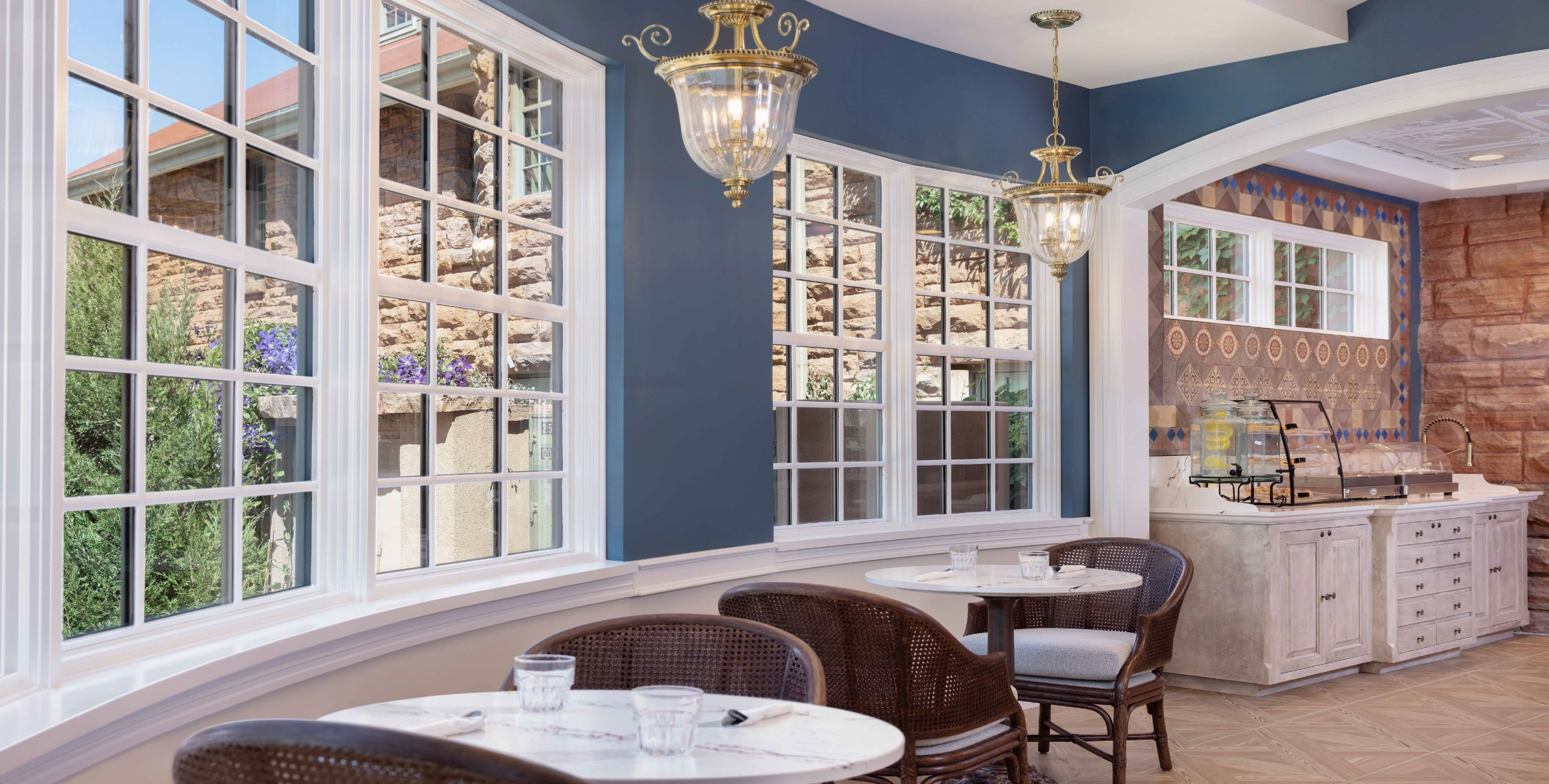
GLENWOOD HOTSPRINGS RESORT – HOTEL 1888 RENOVATION | GLENWOOD SPRINGS, CO