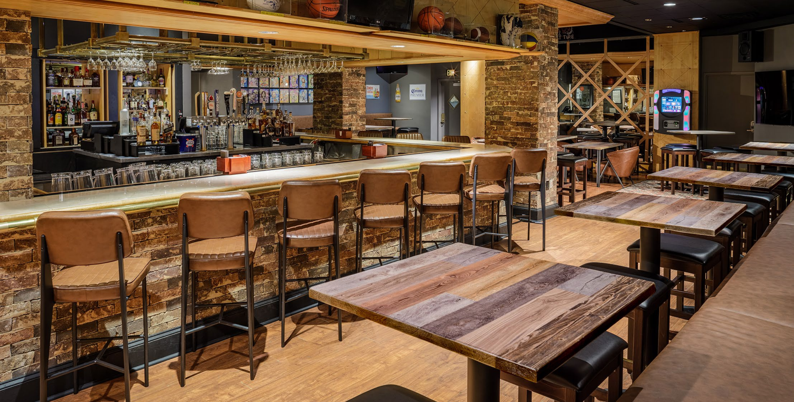
DOUBLETREE BY HILTON – CONFERENCE CENTER AND SPORTS BAR | DENVER, CO