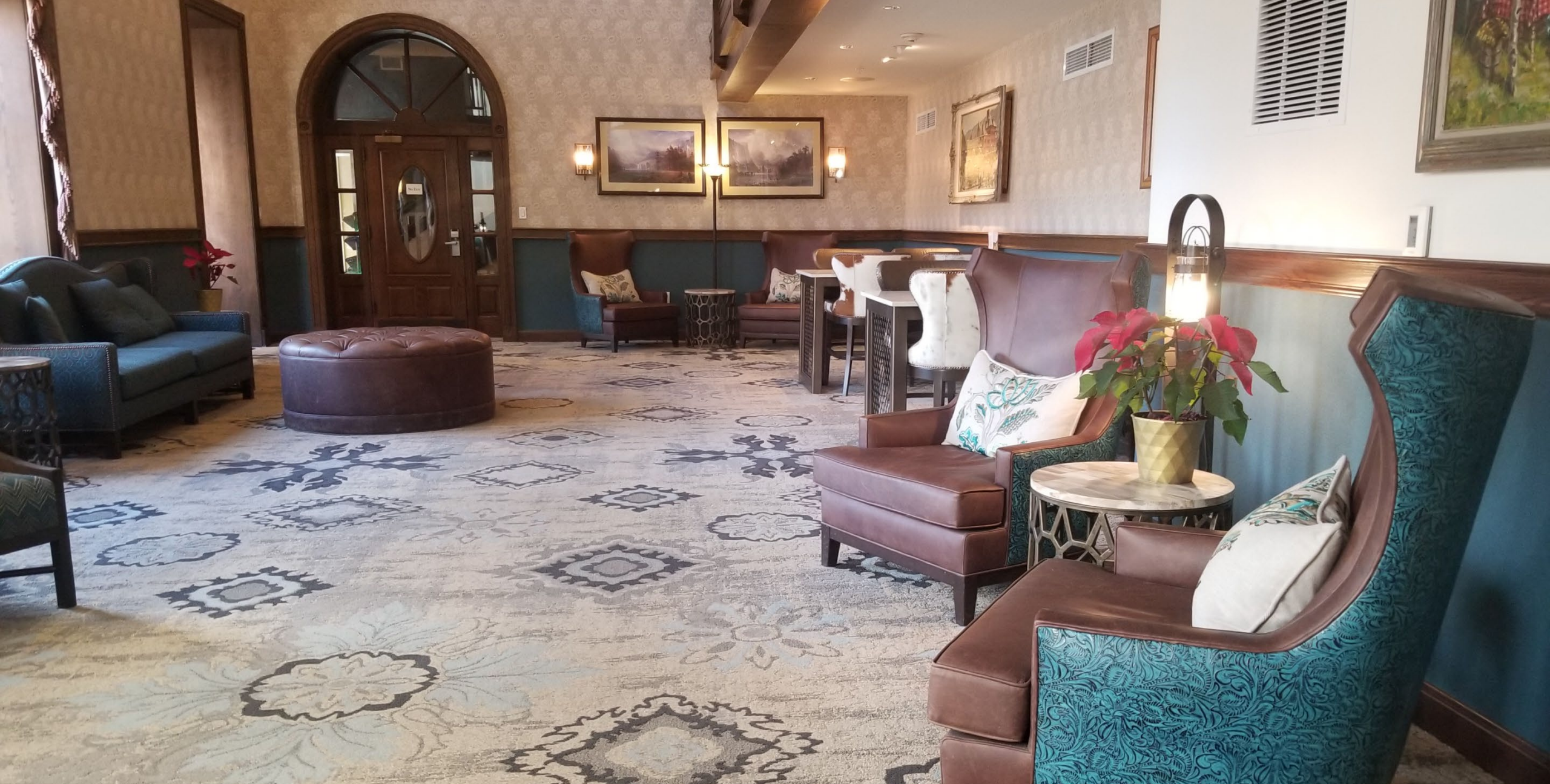
GLENWOOD HOT SPRINGS RESORT – LOUNGE AND CLUB LOBBY RENO | GLENWOOD SPRINGS, CO