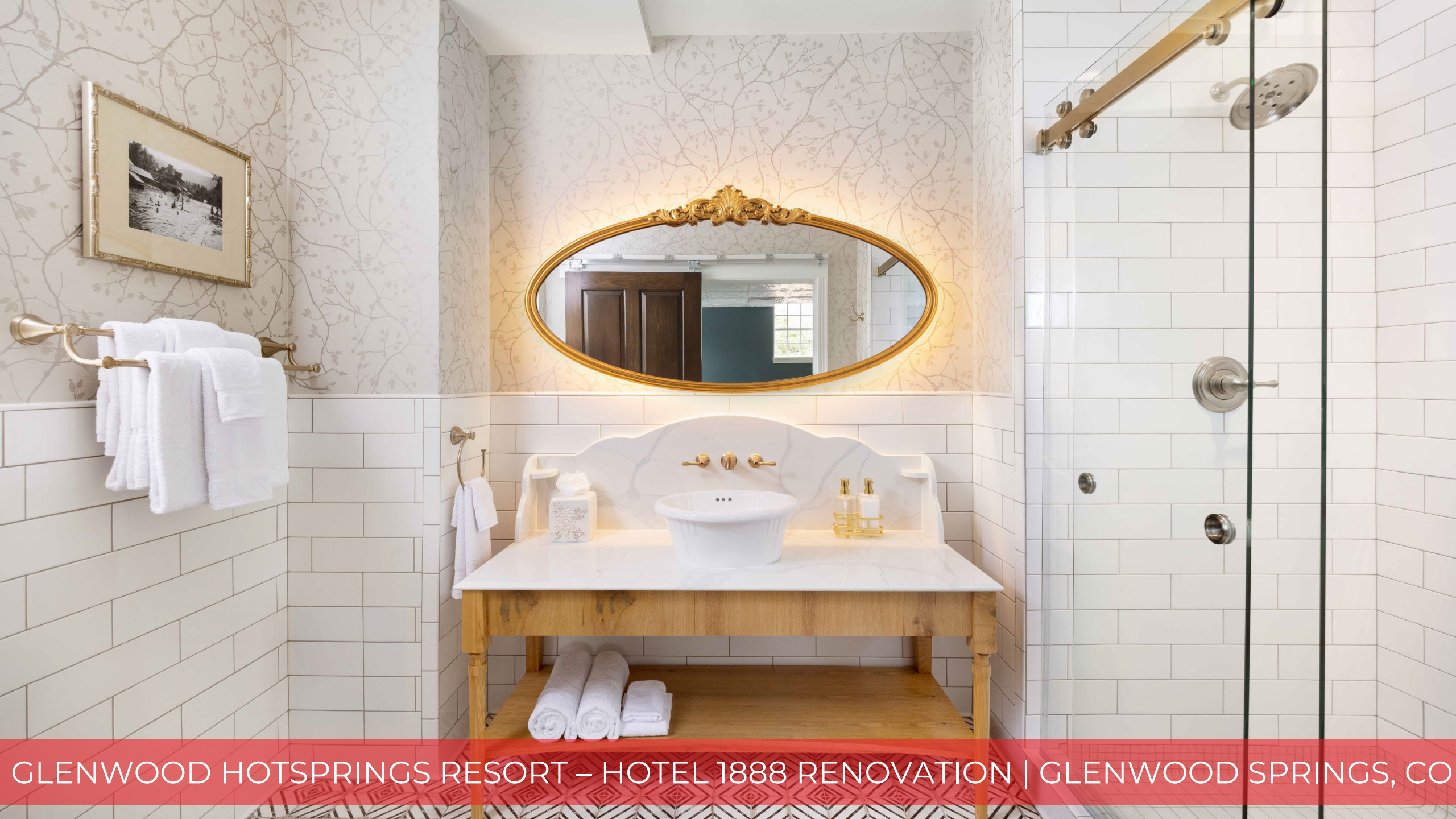
GLENWOOD HOTSPRINGS RESORT – HOTEL 1888 RENOVATION | GLENWOOD SPRINGS, CO