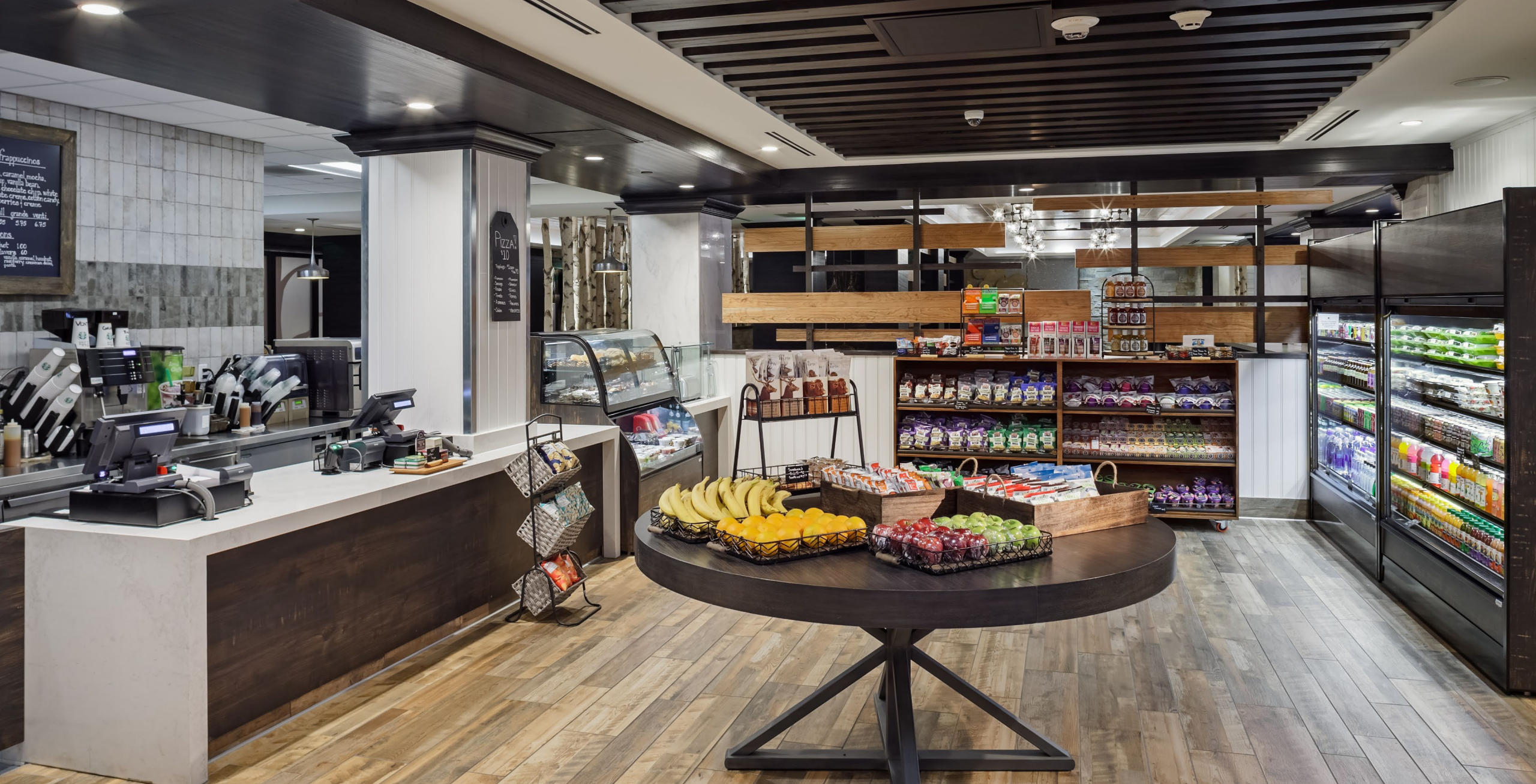
DOUBLETREE BY HILTON – GROUNDED GRAB N' GO | DENVER, CO