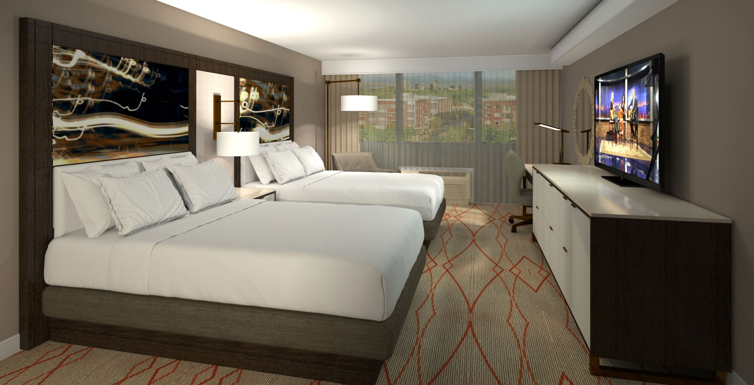
DOUBLETREE BY HILTON – CENTRAL PARK | DENVER, CO