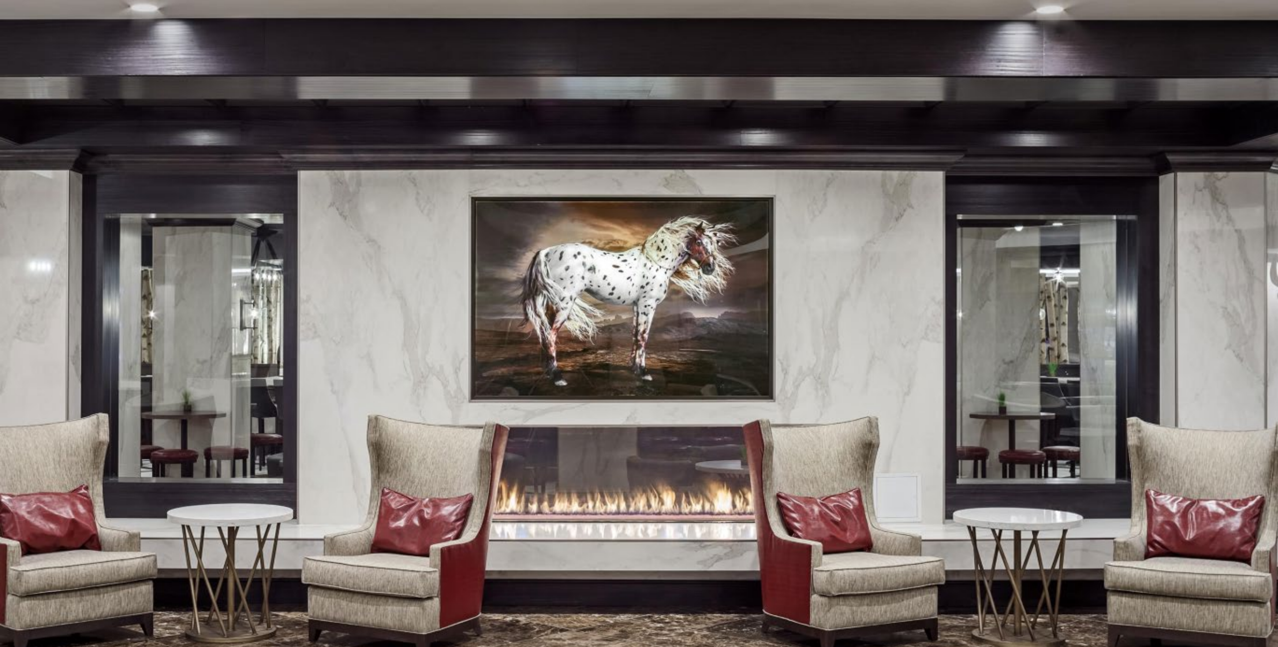
DOUBLETREE BY HILTON – LOBBY | DENVER, CO