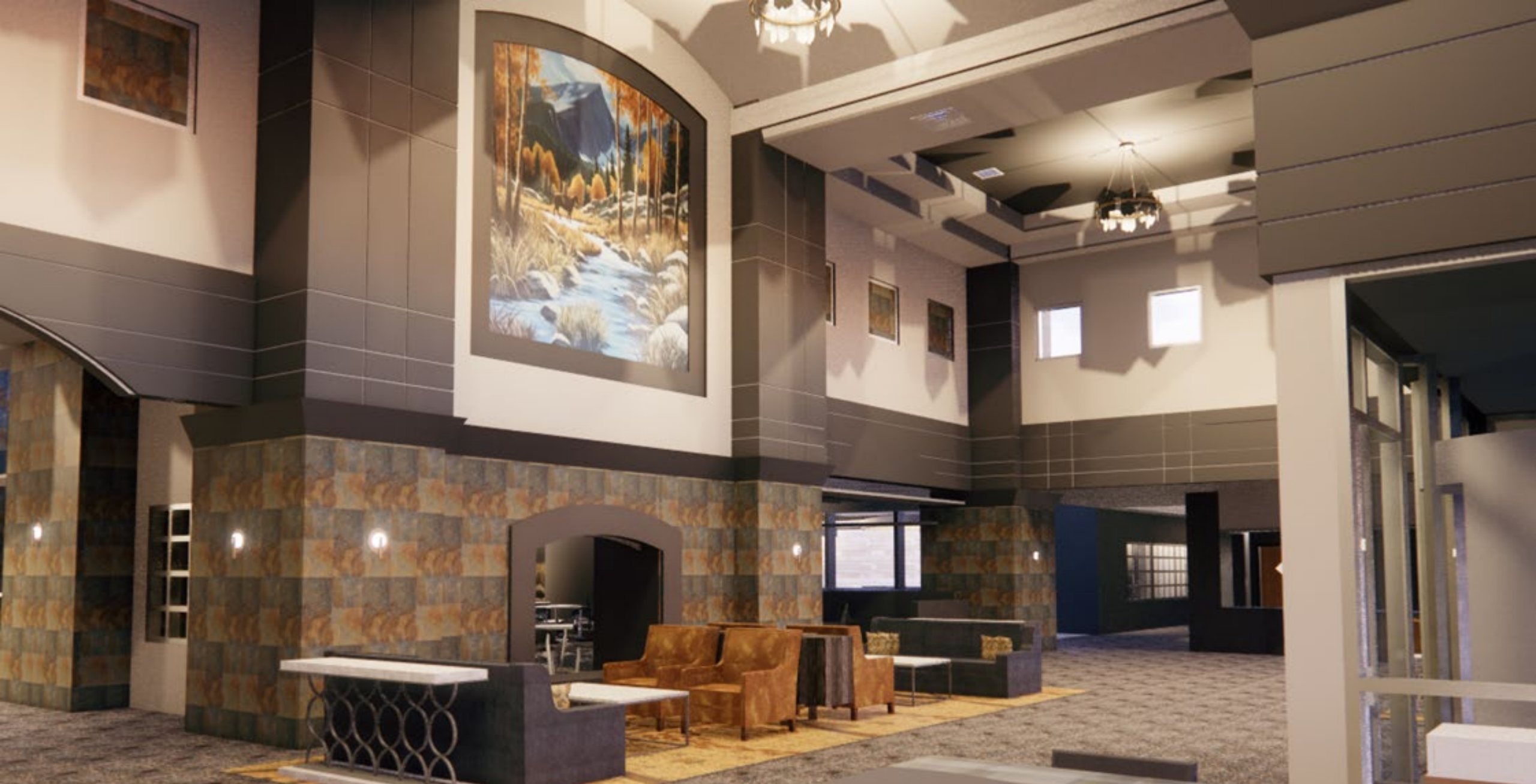
DOUBLETREE BY HILTON – CENTRAL PARK | DENVER, CO (DESIGN ONLY)