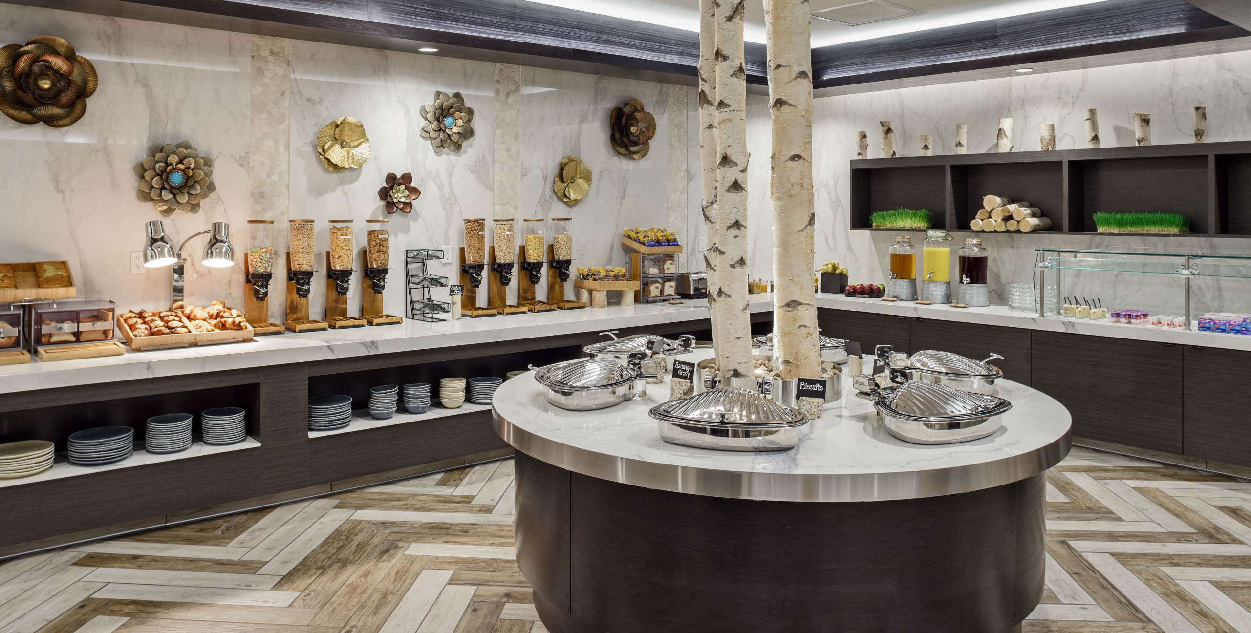
DOUBLETREE BY HILTON – KNIFE AND BOARD RESTAURANT | DENVER, CO