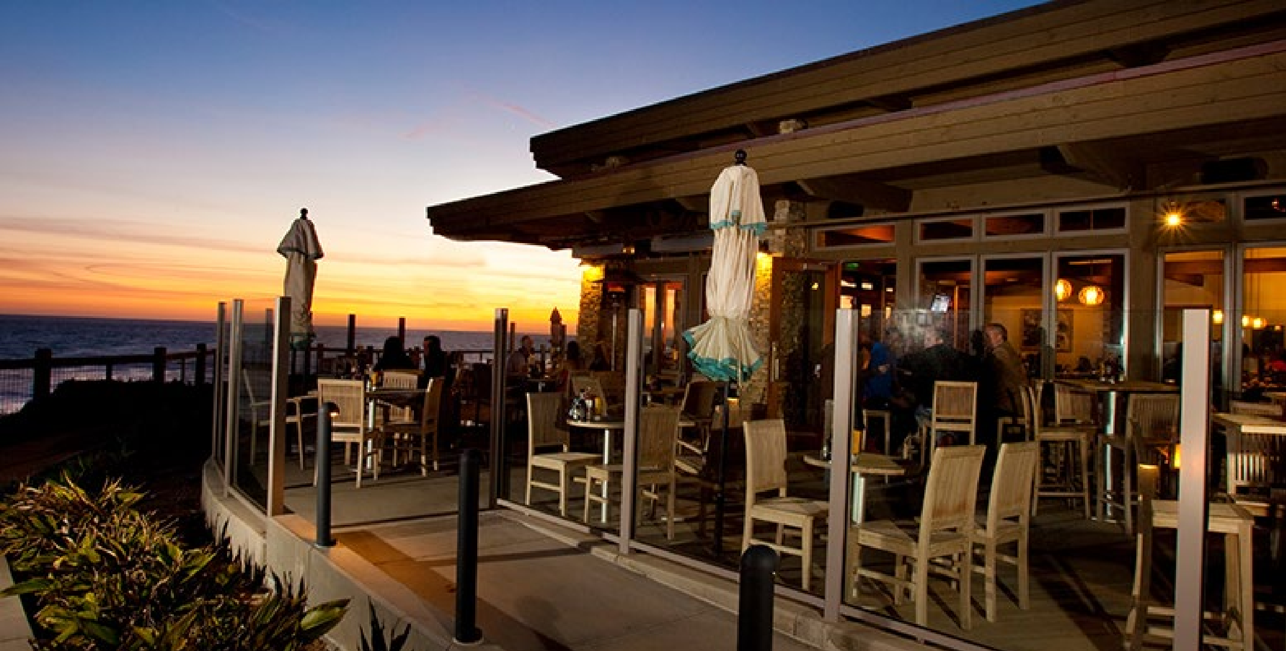
NELSON'S POINT BAR TERRANEA RESORT | RANCHO PALOS VERDES, CA