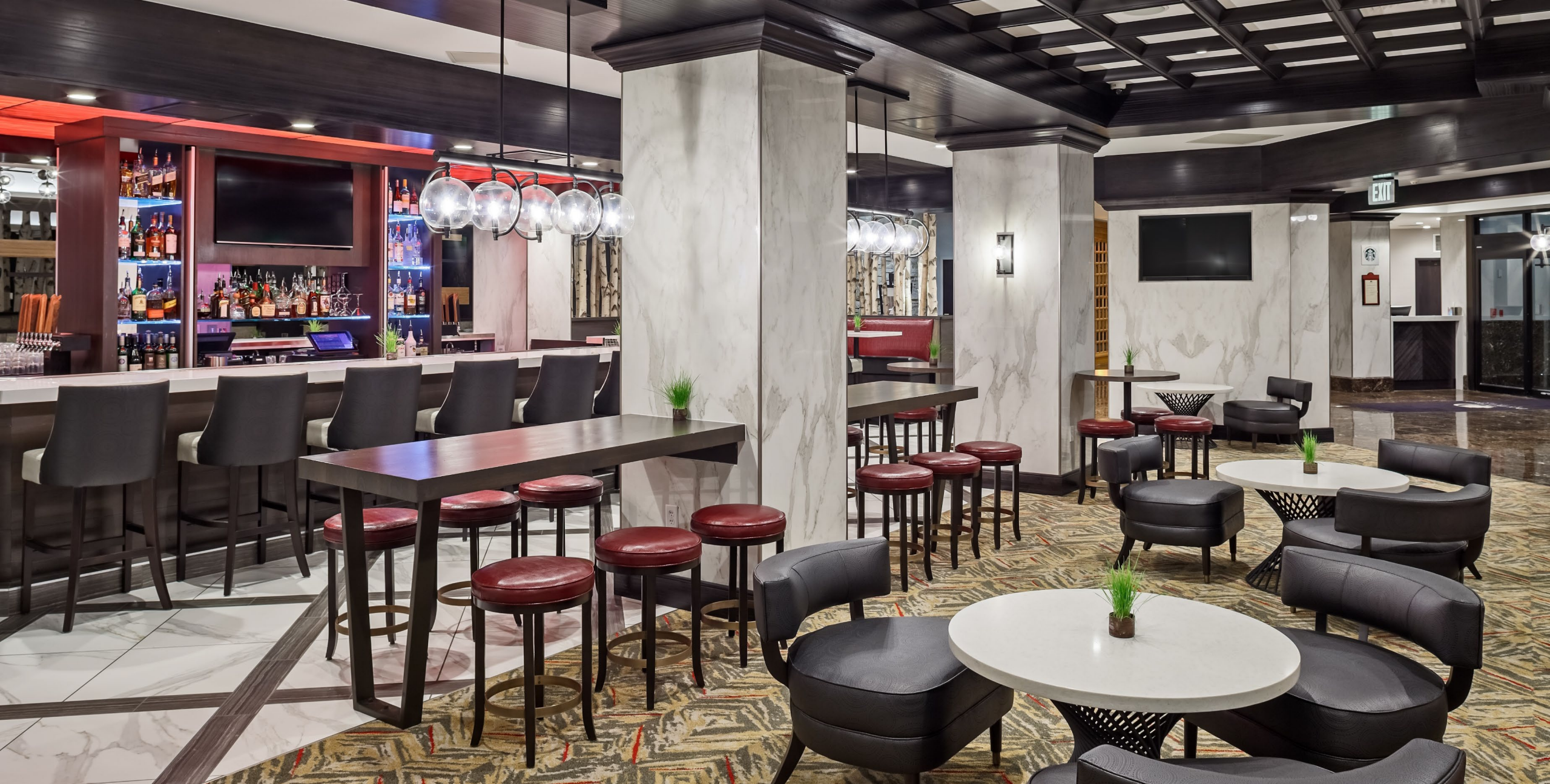
DOUBLETREE BY HILTON – HUB BAR | DENVER, CO