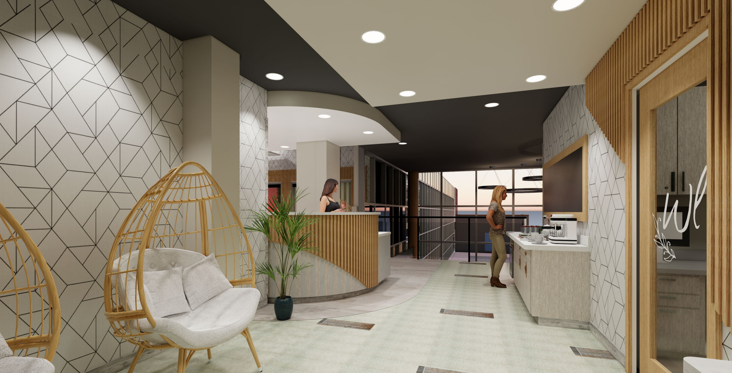
NEWTOWN ATHLETIC CLUB WELL LOUNGE | NEWTOWN, PA