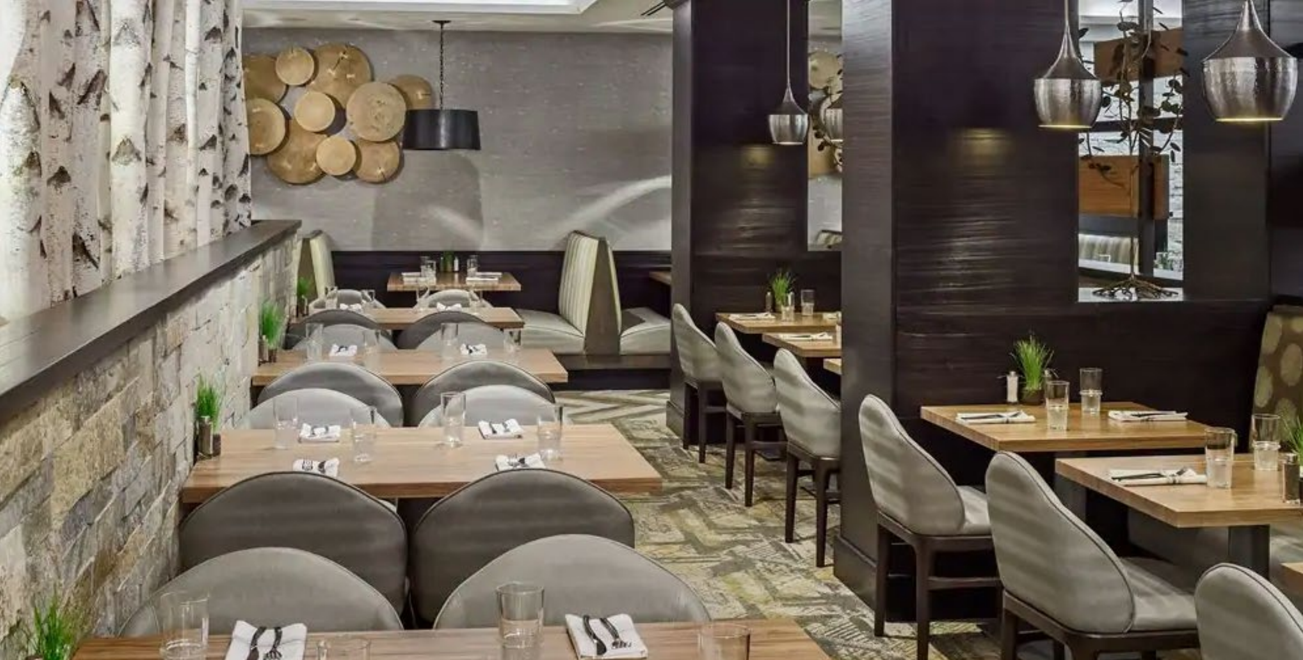
DOUBLETREE BY HILTON – KNIFE AND BOARD RESTAURANT | DENVER, CO