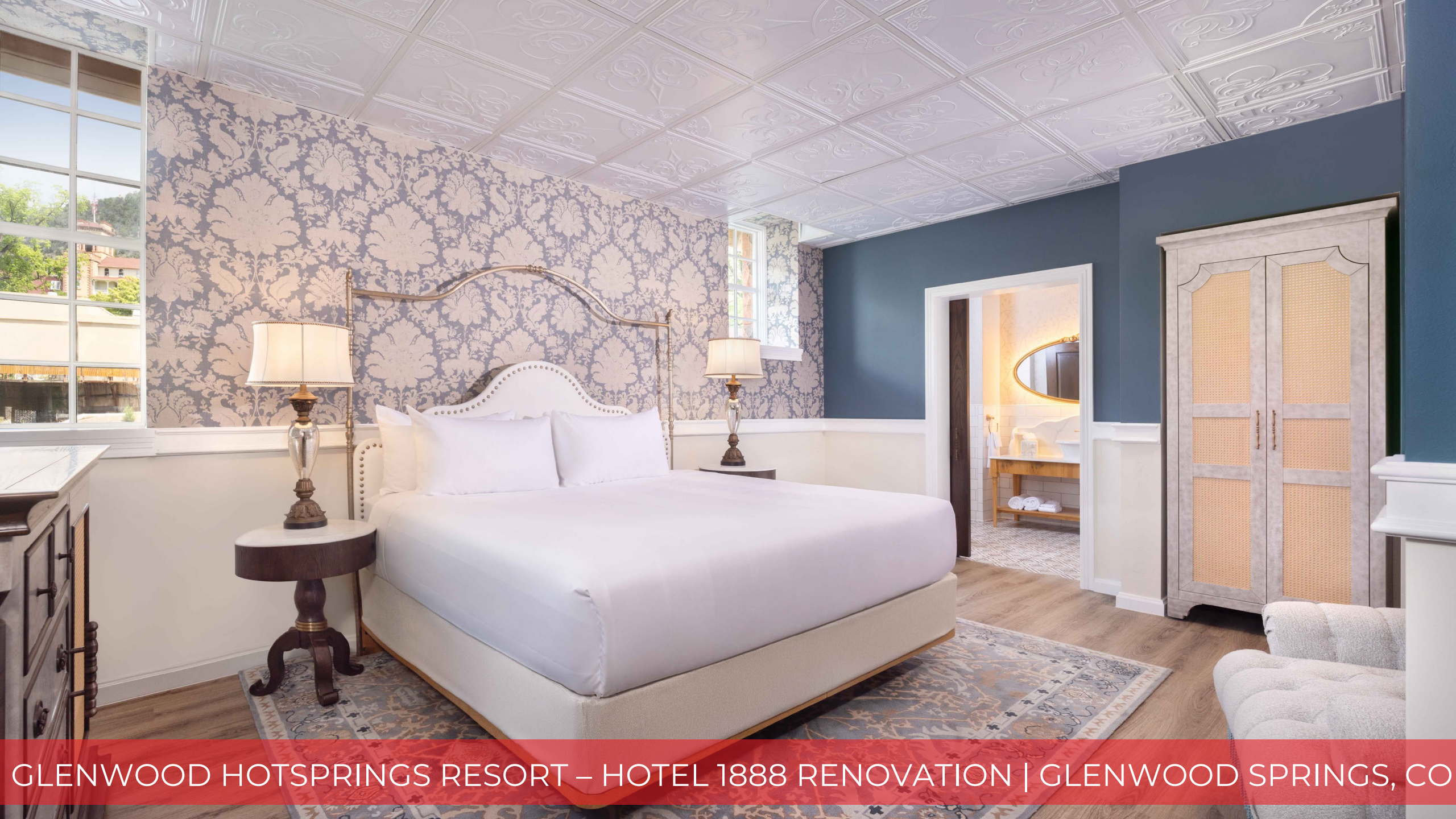
GLENWOOD HOTSPRINGS RESORT – HOTEL 1888 RENOVATION | GLENWOOD SPRINGS, CO