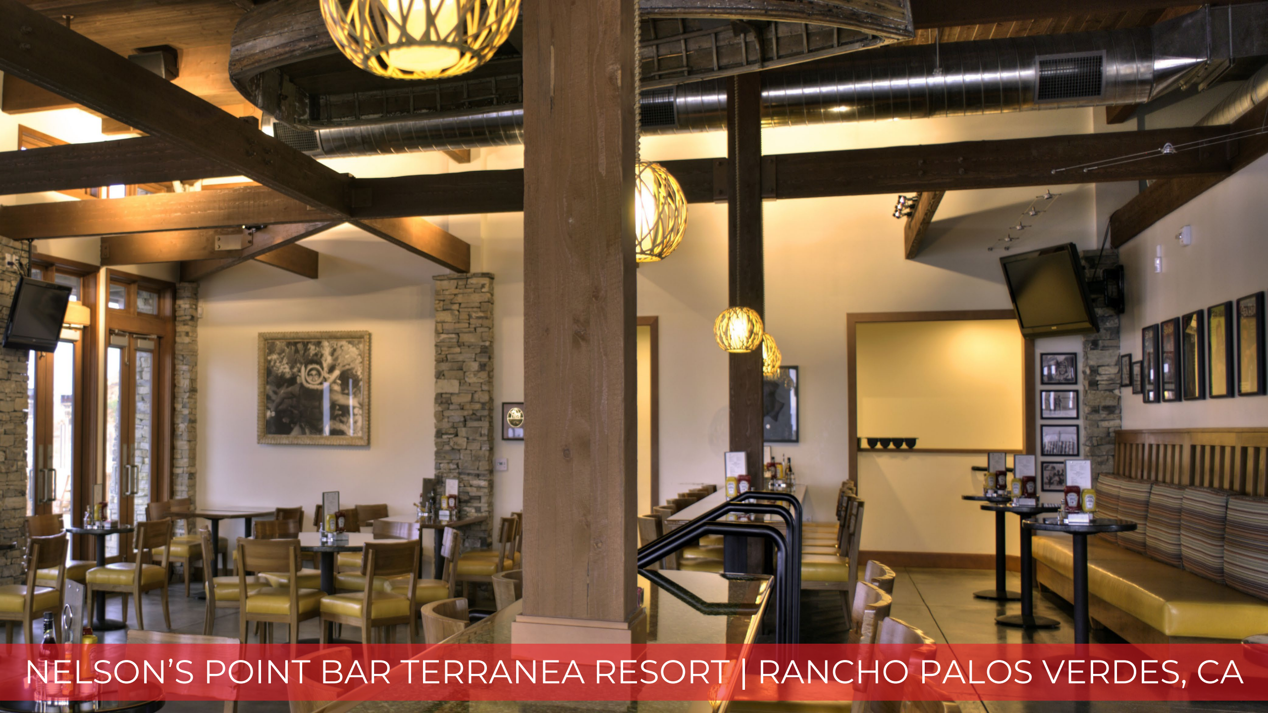
NELSON'S POINT BAR TERRANEA RESORT | RANCHO PALOS VERDES, CA