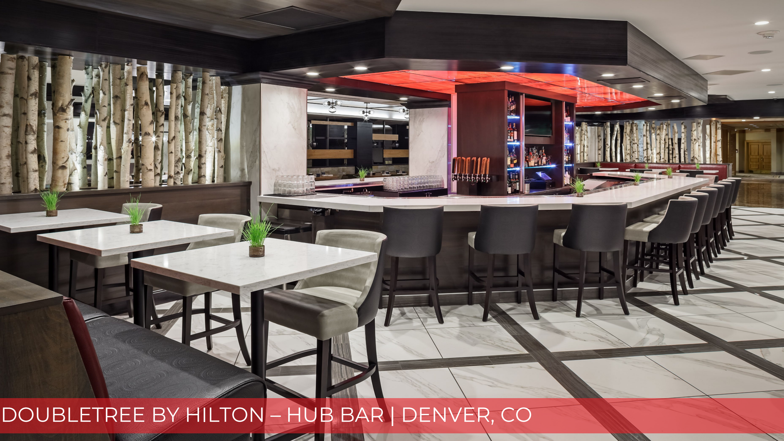
DOUBLETREE BY HILTON – HUB BAR | DENVER, CO